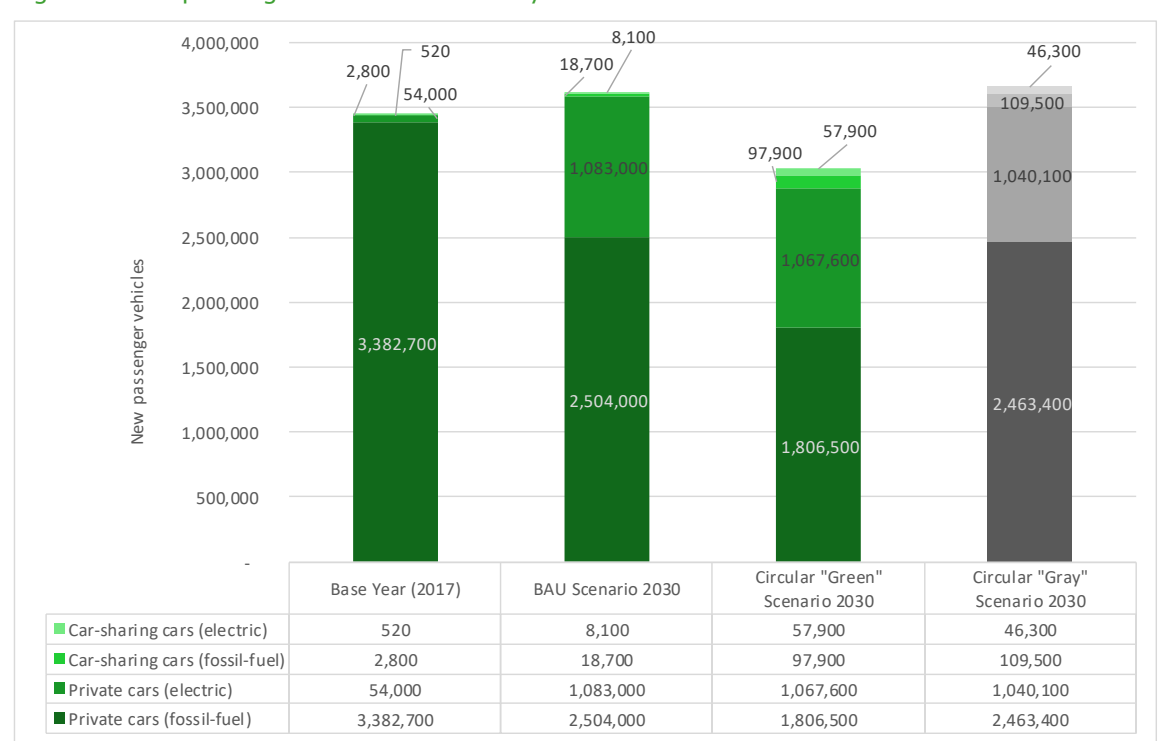
Figure 3. New passenger vehicles in Germany

The circular scenarios differ significantly from the BAU scenario in the way that increases in car sharing could alter the make-up of the vehicle fleet (Figure 4). In the BAU scenario, without a significant share of car sharing and barring changes in usage rates of passenger vehicles, the number of cars would increase by 0.5%, in line with the expected increase in passenger-km. By design, all scenarios have the same electric vehicle fleet (BEV and PHEV) of five million units while in the two circular scenarios the car-sharing fleets are of equivalent size. In the Circular "Green" 2030 scenario with a high replacement ratio, the fleet of fossil-fuel vehicles is reduced quite substantially by 2030, by over 9% compared with BAU. However in the Circular "Grey" 2030 scenario with its low replacement ratio the car fleet even slightly increases with a little bit less than 0.1% compared with BAU.