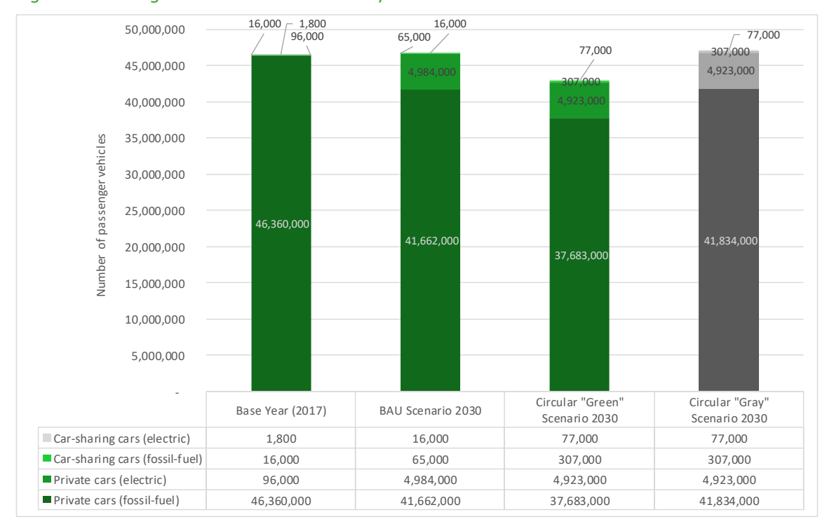
Figure 4: Passenger-vehicle stock in Germany